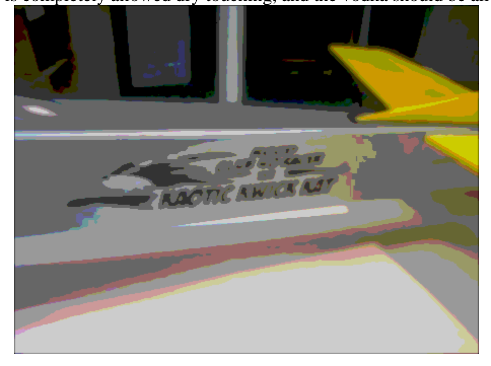
If need any helpf, jush call me. Jush make sh-ore you have vodkaaah!.

*After the transfer paper is completely removed by the vodka and the vinyl decal is in soft press place on the gently plane, the decal with a dry on cloth stuck to the decal completely handling insure the plane is completely allowed dry touching, and the vodka should be all gone!